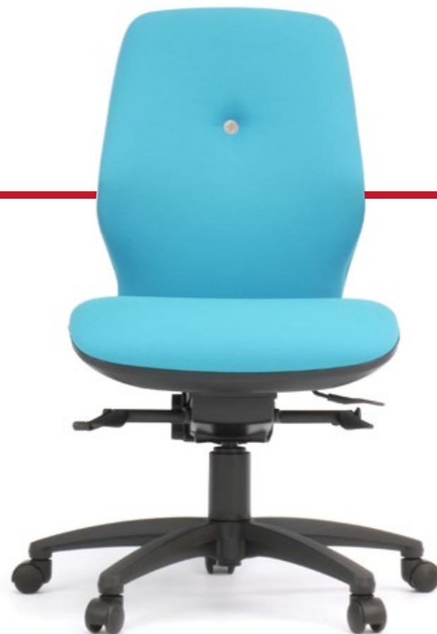
B200 BACKREST S300 SEAT