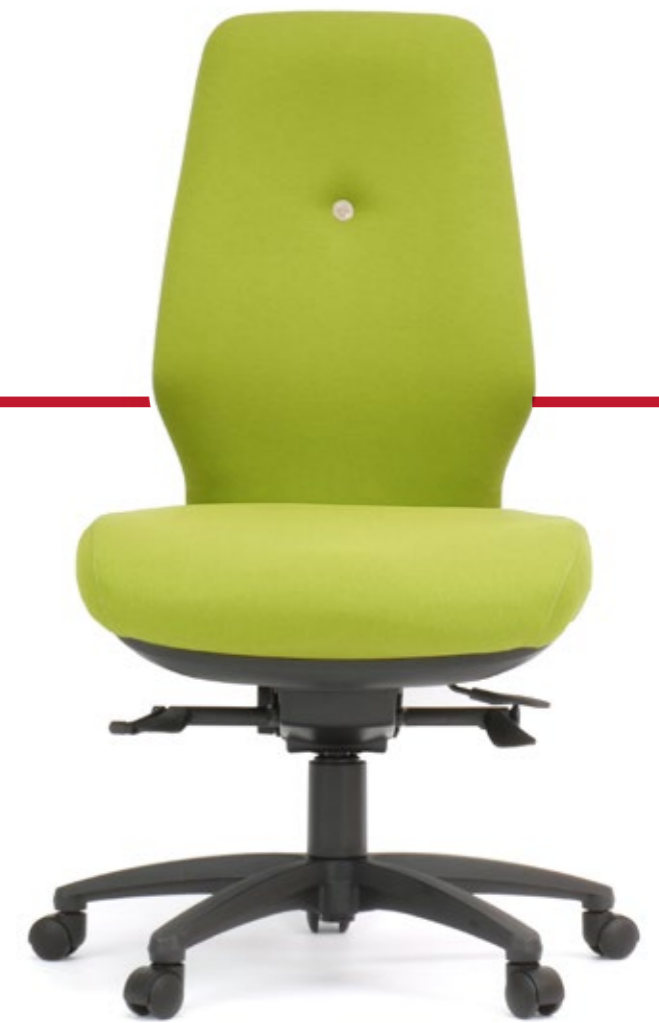
B400 BACKREST S400 SEAT

Choice of four backrests, upholstered both sides, curved to your body shape: