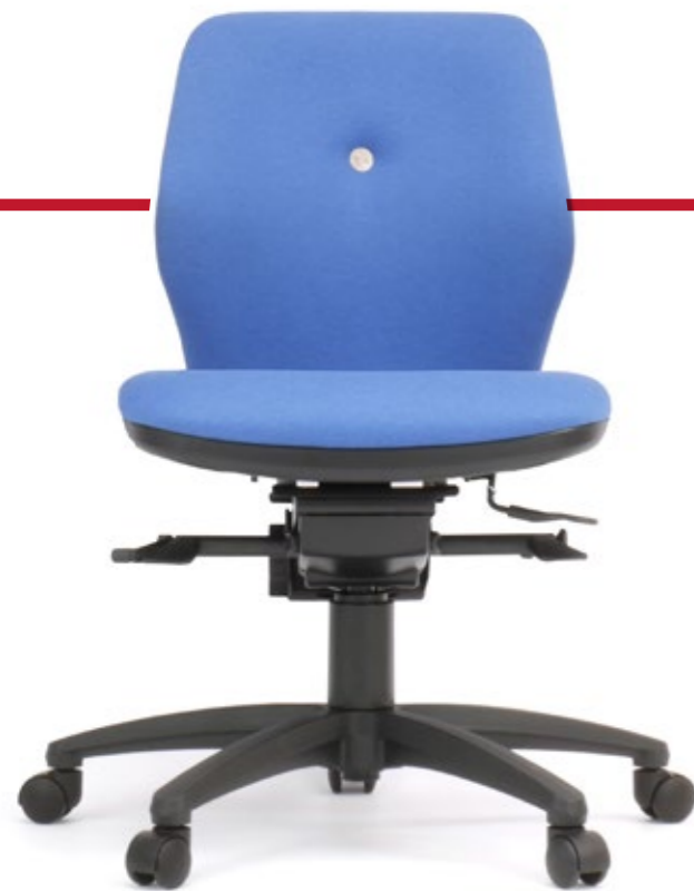
B100 BACKREST S100 SEAT