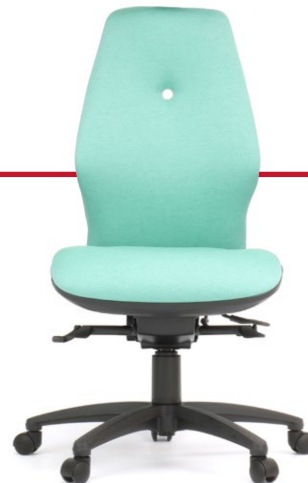
B300 BACKREST S300 SEAT